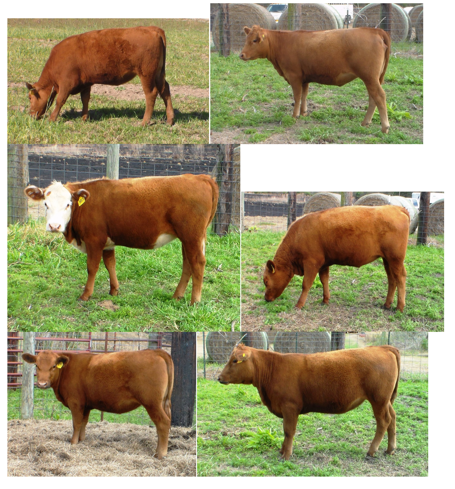
Lots 72-76, Commercial Open Heifers from Scrap Metal Farms, 2226 Gus Perdue Rd., Wrens, GA 30833

Five open Red and Red Baldy heifers calved February-April 2021. Sired by Bull Hill Epic 6289, Reg. # 3739367, a bull in the top 20% of the Red Angus breed for Pro S and Herdbuilder indexes. These heifers are out of commercial Red Baldy and Red Angus females. They have been vaccinated with Virashield 6 and Vision 7/Somnus prior to weaning and dewormed fall and spring with ivermec. Pictured March 2022.