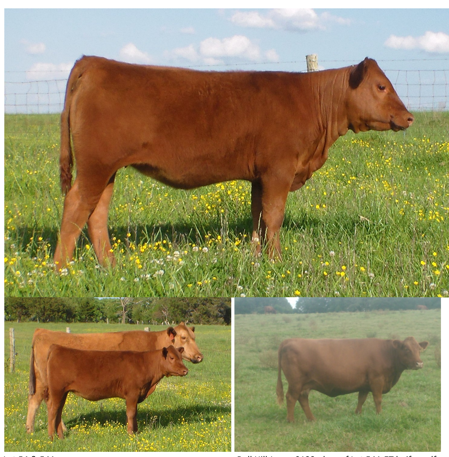
Lot 54 & 54A