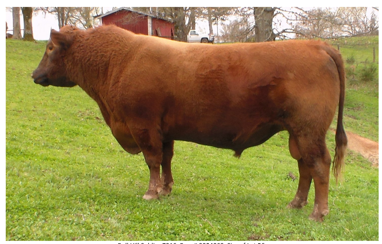
Bull Hill Soldier 7316, Reg. # 3924069, Sire of Lot 56