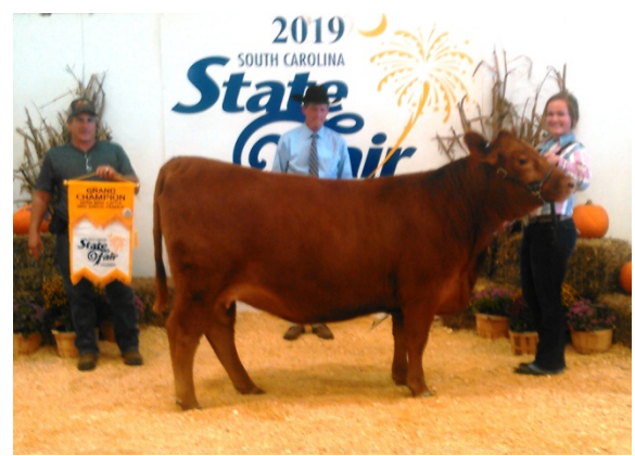
Bull Hill Juana 7260, full sister to Lot 54A

Lot 55, Bred Cow: Bull Hill Wendy 5248, Reg. # 3535361. A beautiful, dark red, easy keeping New Direction daughter from the "Wendy" cow family. Her dam is a second generation ET donor for us, and her sire has been one of the most heavily used AI sires in the breed for several years, for good reason. AI bred on 3/30/22 to our exciting new herdsire, LASO Alamo C92H, Reg. #4295093, who offers powerful outcross genetics with the best carcass ultrasound/performance combination in the breed. His first calves look tremendous!