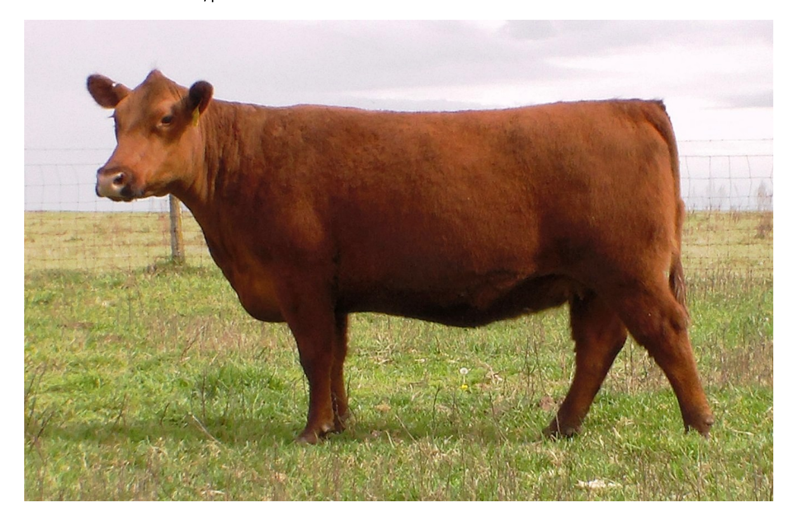
Lot 55, Bull Hill Wendy 5248

Lot 55, Bred Cow: Bull Hill Wendy 5248, Reg. # 3535361. A beautiful, dark red, easy keeping New Direction daughter from the "Wendy" cow family. Her dam is a second generation ET donor for us, and her sire has been one of the most heavily used AI sires in the breed for several years, for good reason. AI bred on 3/30/22 to our exciting new herdsire, LASO Alamo C92H, Reg. #4295093, who offers powerful outcross genetics with the best carcass ultrasound/performance combination in the breed. His first calves look tremendous!